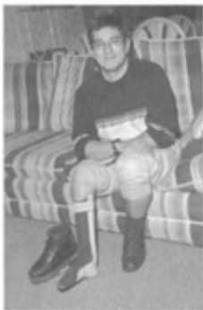
Holland Sentinel website