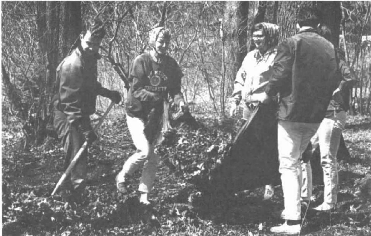
Hope College/Joint Archives

Contact us at (616) 395-7798 • Fax (616) 395-7197 • Email archives@hope.edu • www.jointarchives.org