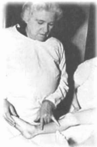
Allina Hospitals & Clinics website