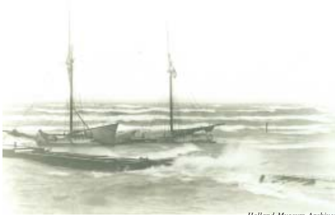
Holland Museum Archives