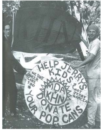
Can drive to raise money for the annual Labor Day Telethon, 1996

In 1996, several activities kept the Knickerbocker men busy. The group kicked off the year with a can drive to