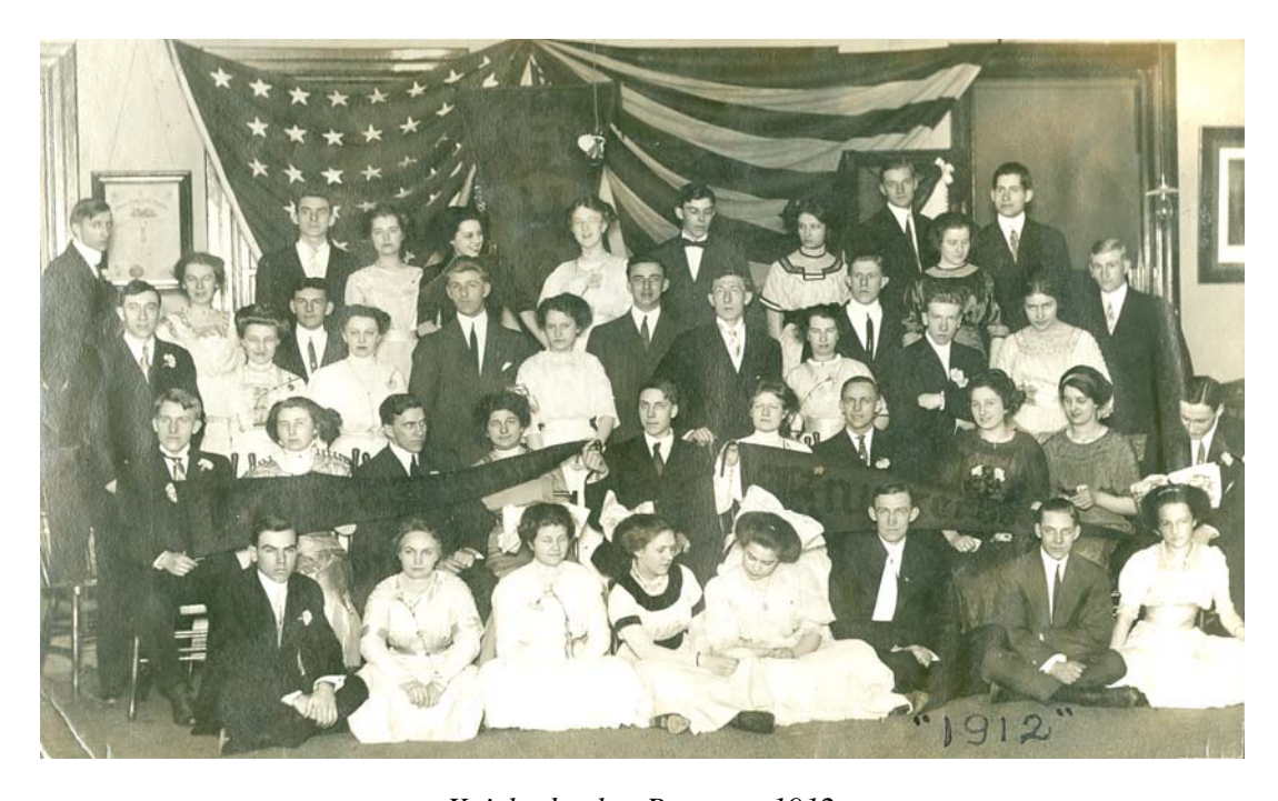
Knickerbocker Banquet, 1912

Contact us at (616) 395-7798 • Fax (616) 395-7197 • E-mail: archives@hope.edu • www.jointarchives.org