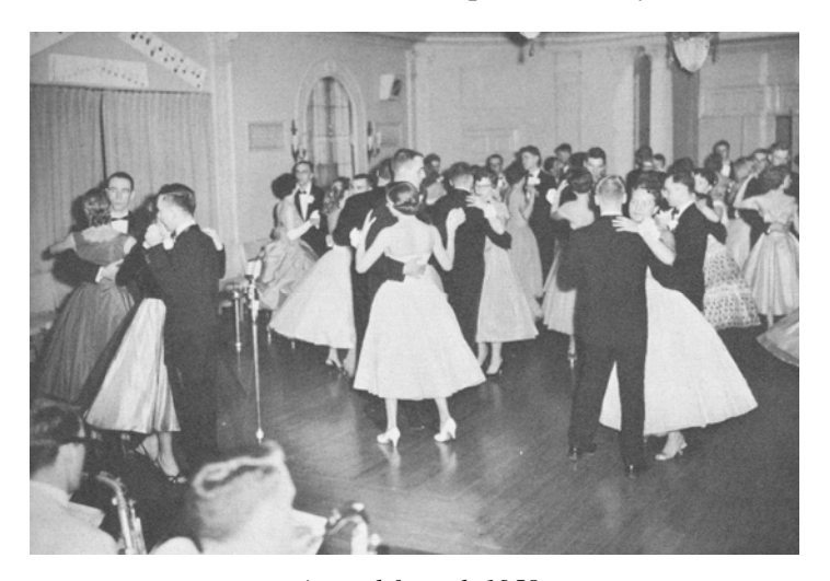
Annual formal, 1958

In 1958-1966, the Knicks worked together in interfraternity sports (winning the All Sports Trophy), the All College Sing, and a host of fraternity parties, which the Knicks are most known for. As for projects, the men devoted several afternoons to work at Prestatie Huis [Achievement House], continued the operation of their walking Blood Bank, and repaired the radios in the clinic donated by the brothers in 1942. In 1958, the Knickerbocker men were excited to finally move into Knickerbocker Hall (which is the present Lichty Hall.)