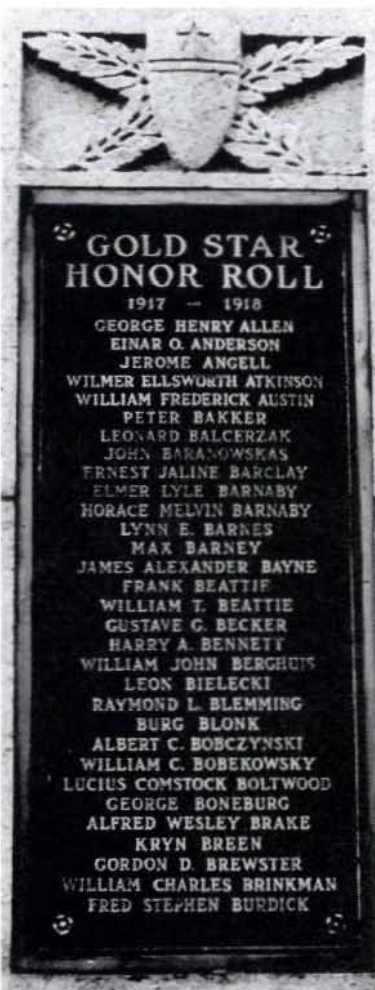
War Memorial Plaque Grand Rapids