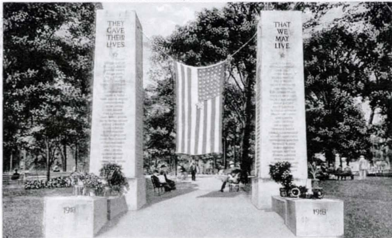
210—Soldiers' Memorial Monument, Fulton Street Park, Grand Rapids, Mich.

Contact us at (616) 395-7798 • Fax (616) 395-7197 • E-mail: archives@hope.edu • www.jointarchives.org