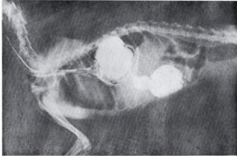
Lateral lateral contrasted radiographic aspects, evidencing formations coated by radiological contrast, relating to esophagus.