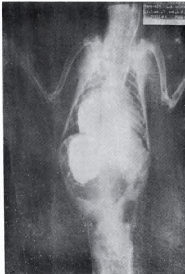
Ventral dorsal radiographic aspects, showing formations projecting laterally to the esophagus.