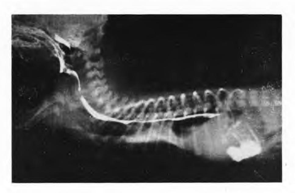
Flg. 1 — Right side. Dorsal convexit of the sternum, beginning at the 4th sternebra. "Pectus excavatum".