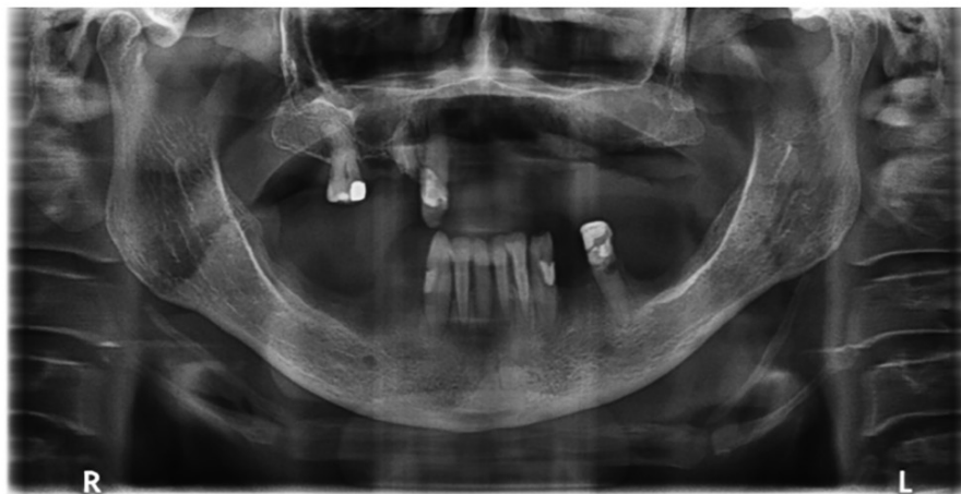
Figure 1 | Panoramic radiograph of the case. Opacification of left maxillary sinus floor and lateral wall.

Due to the presence of bone erosion and the need for maxillary sinus elevation, the patient underwent an endoscopic sinus examination. The final diagnosis was determined through evaluation of sinus content removed during the procedure and defined as mucocele of the maxillary sinus.