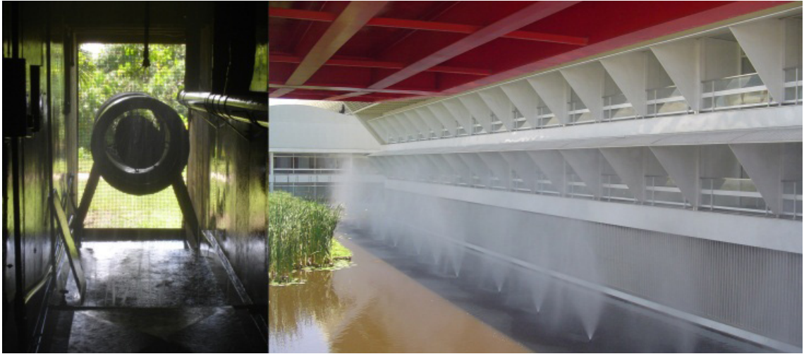
Figure 13. A misting system inside and outside the galleries in Salvador and Rio de Janeiro Sarah Hospital, respectively.

to solve comfort issues. As the system was located inside the galleries, the floor and walls were left completely wet, hindering the maintenance. Thus, in subsequent hospitals, as in the ones of Fortaleza and Rio, this system was located on the outside in water mirrors (Figure 13).