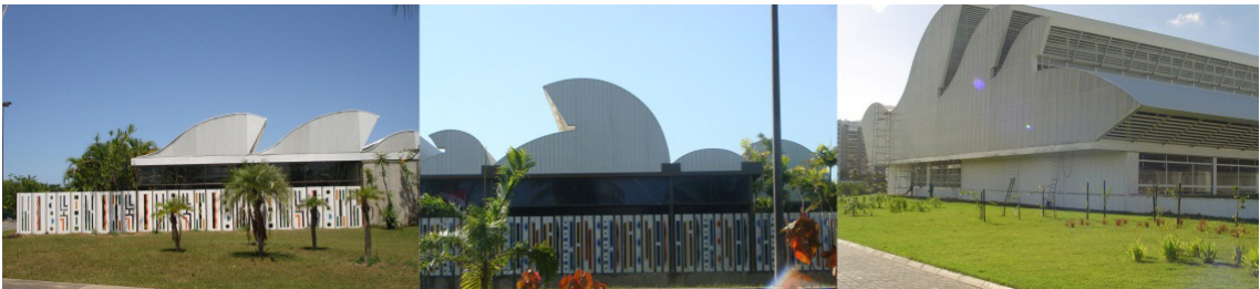
Figure 12. Sheds in Salvador, Fortaleza and Rio de Janeiro Sarah Hospital.

Some design solutions adopted in the hospitals of the Sarah Network can be seen as samples of the evolution provided by the feedback. In Salvador, a frontlet with brise-soleil panels was coupled to sheds to reduce the angle of sun incidence in the hospital. However, the junction between the roof and the frontlet caused infiltration problems in rainy days due to its expansion. Therefore, in subsequent hospitals, such as in Fortaleza and Rio, the frontlet was replaced by an extension of the roof that projects itself forward (Figure 12).