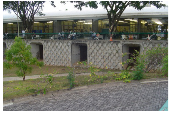
Figures 3 and 4. Natural lighting in Rio de Janeiro Hospital and natural ventilation in Salvador Hospital, respectively.

Until the year 2000, the CTRS produced buildings for the Sarah Network and others for the Federal Government of Brazil not related to the network. Since 2000, the Federal Government has restricted the production of CTRS to the Sarah Network buildings. Considering the Sarah Network has no plans of building other hospitals, now the center is only working in the maintenance of the existing hospitals and in the production of hospital equipment. Only three of the five existing workshops are actively working: 1) heavy and light metallurgy, now concentrated in the same space; 2) woodworking; and 3) plastics. In 2012, the ferrocement workshop was practically stopped. At the time, the staff of almost 800 employees was reduced to 230, of which 40% are in the metal workshop, 30% in woodworking, plastic, precast and maintenance, and 30% in administration and support.