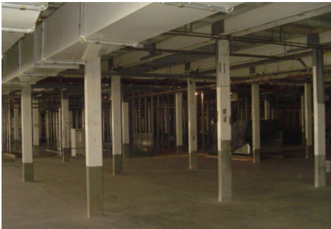
Figures 8 and 9. Precast ferrocement walls, double ferrocement panels and underground galleries of the Sarah Hospital of Rio de Janeiro.

The design solutions created by Lelé are sophisticated and facilitate maintenance. For instance, there are mobile ceilings and a great roof in the sheds of the Sarah Hospital of Rio de Janeiro, always presenting a height of more than 8 meters between them, which requires rigorous maintenance for the system to work properly. For the maintenance of such devices, walkways were designed to facilitate the access (Figure 10). Furthermore, Lelé developed some equipment to facilitate the cleaning service, that by its turn, runs on rails located in the roof (Figure 11). If the maintenance and its costs are not considered in the design solutions, the building performance may be adversely affected.