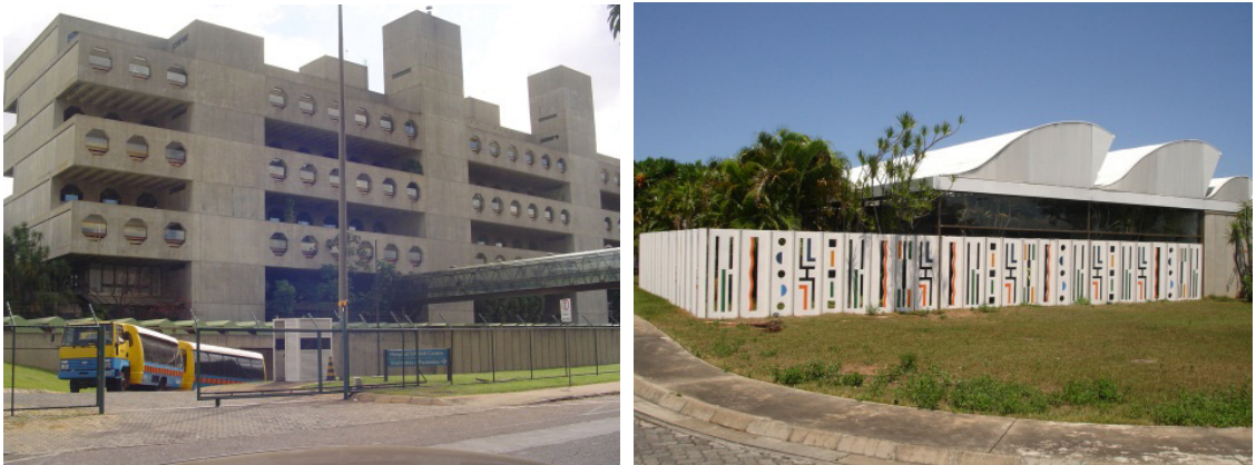
Figures 1 and 2. Sarah Hospitals of Brasília and Salvador.

The first hospital was built with precast concrete, using Vierendeel Beams. Until 1978, Mr. Lima constructed buildings with heavy pieces made of precast concrete, and few elements of precast ferrocement (Figure 1). Thenceforth, his designs have evolved and the hospital in Salvador is characterized as a contemporary and fully industrialized building (Figure 2).