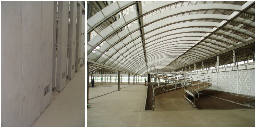
Figures 6 and 7: Wall precast ferrocement walls and metallic structure of the Sarah Hospital of Rio de Janeiro, respectively.

As the constructive system of the hospitals of the Sarah Network was industrialized, the work in the site of the construction was mainly the assembling of the industrial components produced in the plant. Therefore, schemas were developed to facilitate and speed the assembling (Figures 6 and 7).