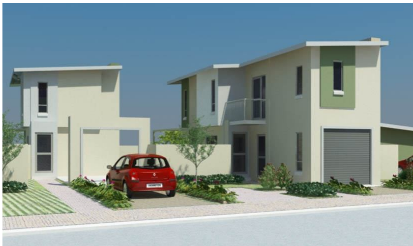
Figure 2: Phase 1 – 57m2 (Left) & Phase 2 – 99m2 (Right)

Phased incremental units were designed to increase the range of affordability and allow end-users to enter the market in accordance with their income and loan qualifications as well as to make extensions possible in an organized manner; not losing the character of a particular development.