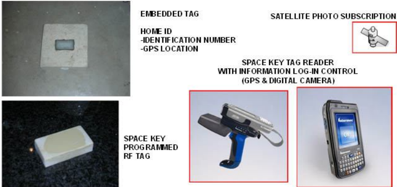
Figure 5: Programmed Hardware