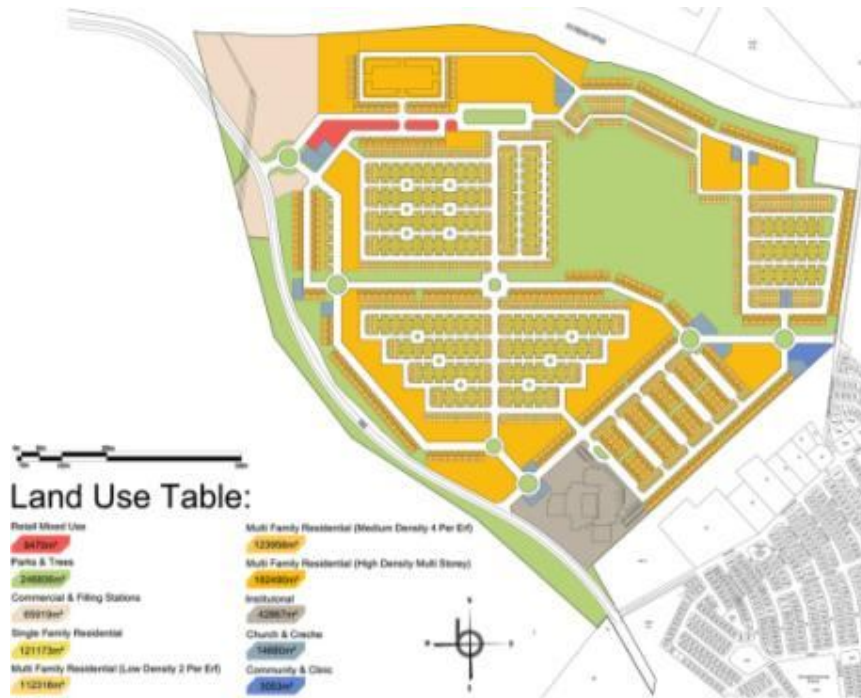
Figure 1: Urban Framework of Hillside in Despatch

This principle was applied in Hillside in Despatch in the Nelson Mandela Bay Metropole. To improve affordability, the number of units was increased from 3,700 to 5,390 – an average density of 45 residential units per hectare (121 hectares). Public open spaces and other development criteria including environmental issues are still in accordance with general development requirements of the Metro.