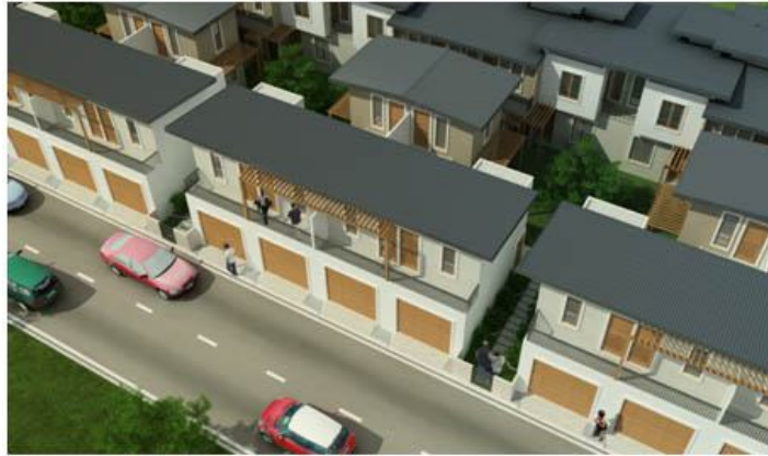
Figure 3: 4 Units, 1 Entrance, Communal Courtyard & Rental Rooms on top of Garages

Everybody wants his own address that is not only a number on the wall but something that is different and can be referred to.