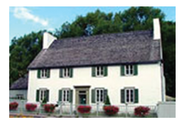
Figure 1. Maison des Jesuites-de-Sillery, 1637, Quebec, from www.ville.quebec.qc.ca.

Canada is young in terms of heritage structures compared to most of the rest of the world. Our oldest masonry structures date from the mid 17th century (eg: Figure 1). Many masonry structures were built by immigrants from Europe who used the same techniques they had been taught in their countries of origin, which would typically have been France and Great Britain during initial settlement from that continent. However, the Canadian climate is considerably harsher in terms of freeze-thaw cycles than these masons were accustomed to, consequently the rate of deterioration of these structures was, and can still be, significantly more rapid than one would expect of the same construction in the original homelands of the masons (Figure 2). The need to conserve this relatively young heritage for the benefit of future generations is beginning