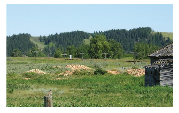
Figure 3. All that remains of a brick plant in Alberta, opened in 1912, closed in 1914.

be in the country of origin of most immigrants to Canada.