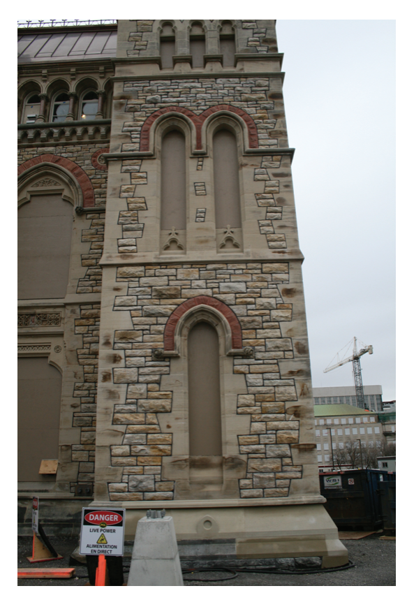
Figure 4. A section of the restored Westblock, on Parliament Hill, Ottawa. Note that the black mortar in the Nepean sandstone and the red mortar to match the red Potsdam sandstone above the windows follows photographic and written evidence that this was the form of the original construction.

The important issue is that there is a need to take a different approach with these buildings, compared to the design of a new building with current codes of practice. We need to understand how these buildings will respond to a given load. It is inappropriate simply to assume the worst possible condition and overdesign the "strengthening" of the building because that may just make it worse without knowing it and destroy the very asset that we are trying to protect in the first place. The goal is to make it safe for the public and to protect the heritage character of the building for all to enjoy. A restored section of the Westblock on Parliament Hill is shown in Figure 4. With sufficient, relevant knowledge it is possible to achieve good outcomes, but these must be maintained.