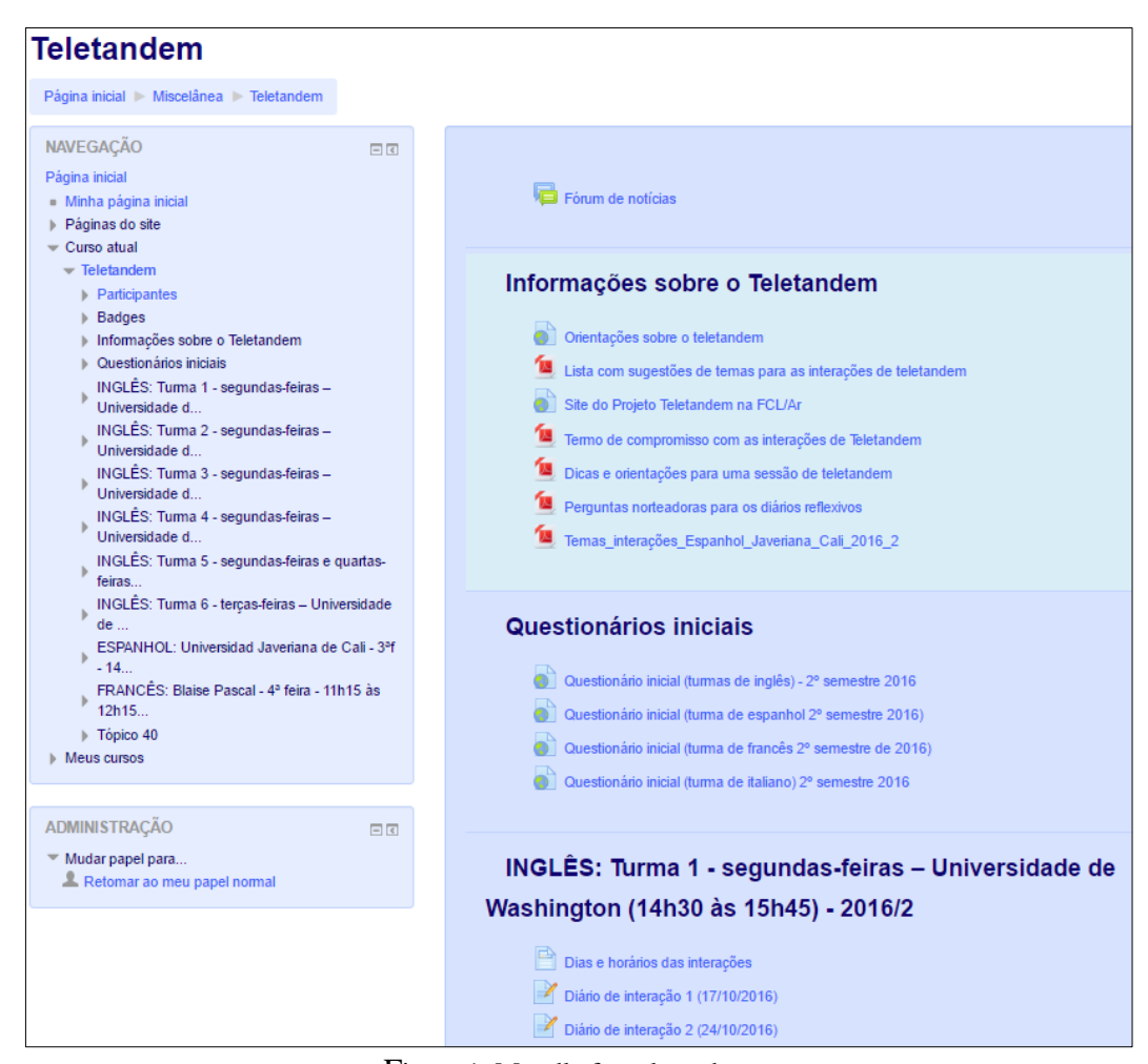
Figure 1: Moodle for teletandem management

Figure 1, below, shows a print screen of the Moodle platform used for teletandem management on our campus: