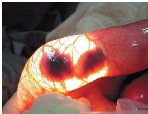
Figure 1 - Detection of lesions by enteroscopy (transillumination).

Diagnosis can be established by upper endoscopy and colonoscopy. Soft tissue masses not specific for hemangiomas can be revealed by CT scans. Selective arteriography and