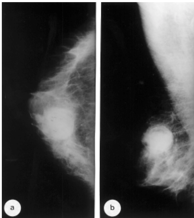
Figure 1 - Craniocaudal (a) and mediolateral (b) mammograms reveal a partially defined dense node.