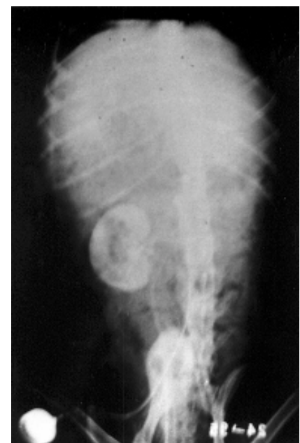
Figure 1 - Postoperative excretory urography of a group II dog, showing complete exclusion of the left kidney and maintained vascularization and excretion of the right kidney.

The present study showed important alterations in kidney morphology accompanied by functional loss after left renal vein ligation. Group III dogs with only the left kidney presented