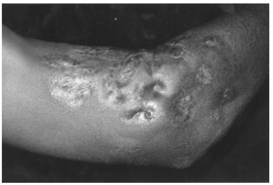
Figure 1 - Typical mycetoma lesion on the right elbow. Two components of the mycetoma triad can be observed: tumefaction and draining sinuses. Grains, the third component of the triad, were observed on direct examination.

A 31-year-old black man presented to the University of São Paulo Dermatology Outpatient Service complaining of swelling of the right elbow. Examination disclosed marked local tumefaction, induration, and draining sinuses (Fig. 1). Expression of the lesion yielded white-yellowish, 0.5 –1.0 mm, soft grains. Direct examination of 10% KOH clarified grains confirmed diagnosis of actinomycetoma. Cultures in Sabouraud agar were repeatedly negative. Histopathology confirmed the previously suspected diagnosis. Delicate actinomycotic filaments were observed