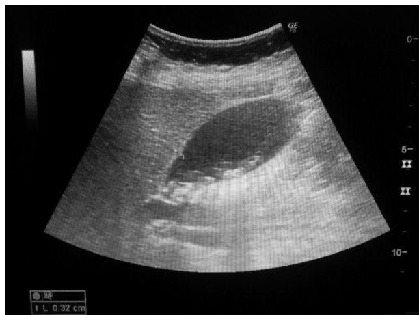
Figure 1. Multiples gallstones demonstrated by an abdominal ultrasound on patient's admission

During hospitalization, the patient had favorable evolution, with improvement of abdominal pain and jaundice, and progressive decrease of liver enzymes levels (Graphic 1). The patient underwent an open cholecystectomy with intraoperative cholangiography which did not show signs of obstruction (Figure 2), with hospital discharge in the day after surgery.