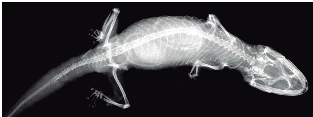
Figure 1. X-ray of a gravid female Phyllodactylus reissii (ZFMK 88739).

with one being quite large and the other being rather small: 9.5 \times 5.8 mm versus 1.5 \times 1.5 mm.