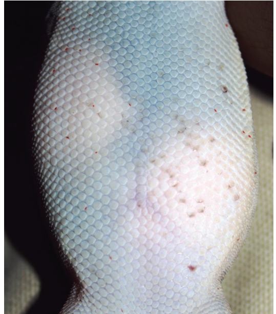
Figure 2. Gravid female of Phyllopezus maranjonensis containing two eggs.

Formerly studied Peruvian populations of Phyllodactylus reissii from Bayovar and Tumbes had a mean SVL of 57.7 \pm 2.7 mm (Huey 1979) and 67.95 \pm 8.01 mm (Jordán 2006), respectively, and voucher specimens of the Natural History Museum of Los Angeles County (LACM) from Amazonas, Cajamarca, Lambayeque, Piura, and Tumbes have a mean SVL of 56.7 \pm 4.7 mm (Goldberg 2007). Thus, the population we studied from the Marañon Region seems to be distinctly larger, with a mean SVL of 74.1 \pm 3.7 mm and 73.6 \pm 4.7 mm for males and females, respectively. These high values might have resulted from the elimination of juveniles from