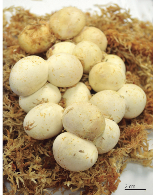
Figure 1. Naturally laid clutch of eggs from L. mexicana , on sphagnum moss.

We determined water-balance characteristics with Wharton's (1985) gravimetric methods that yield identical results with ^3\text{HOH} tracers (Knülle and Devine 1972). Eggs were weighed individually, without enclosure, in less than 1 min with a Cahn electrobalance (precision of SD \pm 0.2 \mu\text{g} , accuracy of \pm 6 \mu\text{g} at 1 mg; Ventron Co., Cerritos, CA, USA). Individual eggs within aggregations were marked with a spot of nontoxic paint (Pactra, Rockford, IL, USA) applied by a single bristle of a soft camel-hair brush (Atlas Brush, Cleveland, OH, USA). Paint had no effect on mass changes (data not shown). An isolated egg acted as the control. To ensure