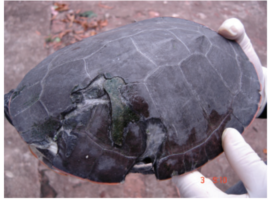
Figure 1 - Traumatic injury in free-ranging Phrynops geoffroanus from Piracicaba River basin, southeastern Brazil.

The results of this investigation demonstrate that the oral bacterial microbiota of P. geoffroanus from Piracicaba River and Piracicamirim stream are composed of a diverse microbial spectrum, with several potential