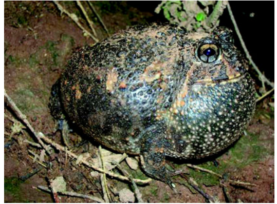
Figure 2 - (A) The Chaco Tortoise ( Chelonoidis chilensis ); (B) the Cei's Escuerzo ( Odontophrynus lavillai ).

Western Paraguay. During the breeding season it appears to be a common species in ponds; we found adults in amplexus, tadpoles, and juveniles.