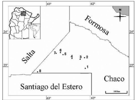
Figure 1 - Region of Impenetrable showing localities explored at this study: P. P. Loro Hablador (1), Fuerte Esperanza (2), El Torito (3), Luján (4), Chiva Mora (5), Primavera (6), Rio Muerto (7), and Taco Pozo (8).

The Chaco Tortoise ( C. chilensis , Figure 2A) is a small terrestrial tortoise characteristic of the Impenetrable woodlands. Although it is an endangered species, the pet trade seems to be the current major treat (Lavilla et al. 2001). Adults showed a high activity during the month