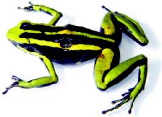
Figure 1 - Epipedobates trivittatus parasitized by larvae of Sarcodexia lambens (Sarcophagidae). This specimen (SVL > 45mm) was found in a small water pool near San Jose village, Peru, in June 2005.

collected, was placed in a ventilated container. Within a week thirty larvae had emerged from the dead frog, and about three weeks later three adults (two males, one female, all = Sarcodexia lambens (Wiedemann, 1830) and deposited in the Zoological Museum, Copenhagen) hatched from their puparia. Unfortunately, wasps of an unknown species had parasitized the remaining larvae.