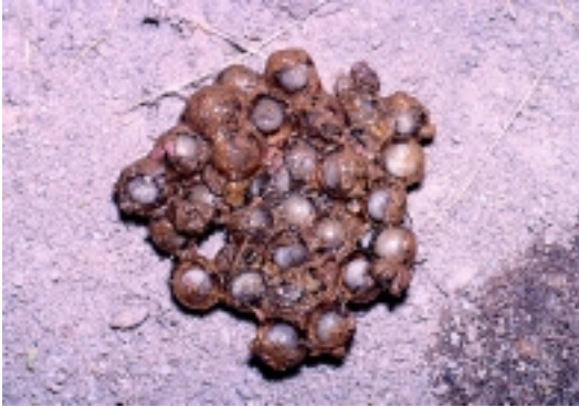
Figure 1 - Egg-mass of Epipedobates flavopictus collected at Vale da Lua, municipality of Alto Paraíso, State of Goiás, central Brazil.