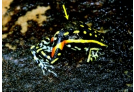
Figure 2 - Adult male Epipedobates flavopictus with tadpoles on dorsum (indicated by an arrow) and exhibiting the reddish femoral stripes of its legs after being disturbed. Individual observed at Santana do Riacho, Serra do Cipó, State of Minas Gerais, southeastern Brazil.

On 18 December 2003 an adult male was observed emitting advertisement calls (169 calls per minute) from a rock crevice during the day. The calls consisted of four to six pulses, of modulated notes with increasing frequency. Mean note duration lasted 92 \pm 81 ms (range 71–98, N = 19 ), and mean inter-note interval was 308 \pm 94 ms (237–486, N = 19 ). The mean dominant frequency was 3.8 \pm 0.02 KHz (3.7–3.8, N = 19 ). These calls were similar to those previously described from other localities (Haddad et al. 1988, Haddad and Martins 1994). On 17 December 2003 an adult male (SVL 28.35 mm, CFBH 6672) was observed during daylight emitting courtship calls, which were similar to the advertisement calls, but with a lower intensity of energy (not recorded), at 5 to 10 cm from a female. They were under a pile of rocks, approximately 10 m from the nearest creek. The female remained quiet for over 10 minutes when the animals were disturbed by the observers.