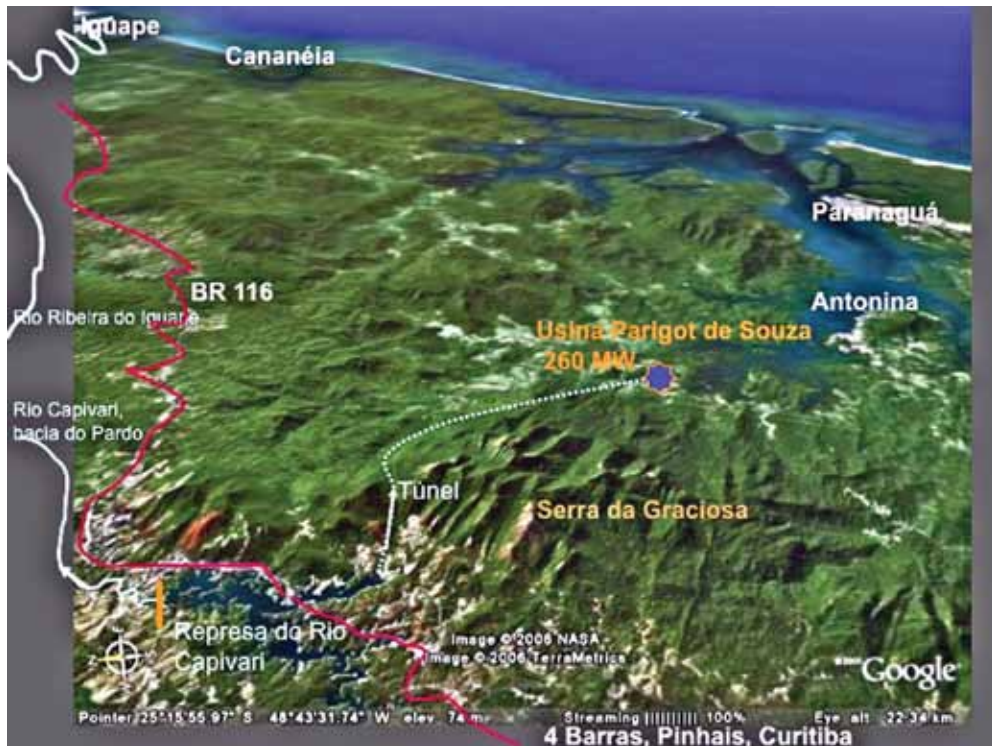
* Figure 1 – Location of the Capivari-Cachoeira System in the Serra do Mar Mountain Range and the Paraná Coast. (Prepared by A. O. Sevá Fo. from a Google Earth image)

The known fact is that all of these sources of the Juquiá and Ribeira Rivers flow down quickly from the Paranapiacaba and Serras do Mar Mountain Ranges through many falls, waterfalls, canyons and rapids, a condition considered necessary in the initial phase of hydroelectric capitalism (early to mid 20 th century) for the successive “utilization” of these waters through dams and power plants.