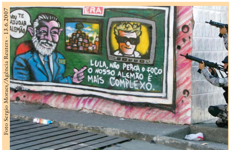
Members of the National Public Security Force get in position during an operation for drugs seizure in the Grota slum, located in Alemão Complex, suburb of Rio de Janeiro.

Another fundamental principle, explicitly resumed by Pronasci of the Plan launched by Lula in 2002, states that security is a State matter, not a government one, being located, therefore, above the political-partisan disputes.