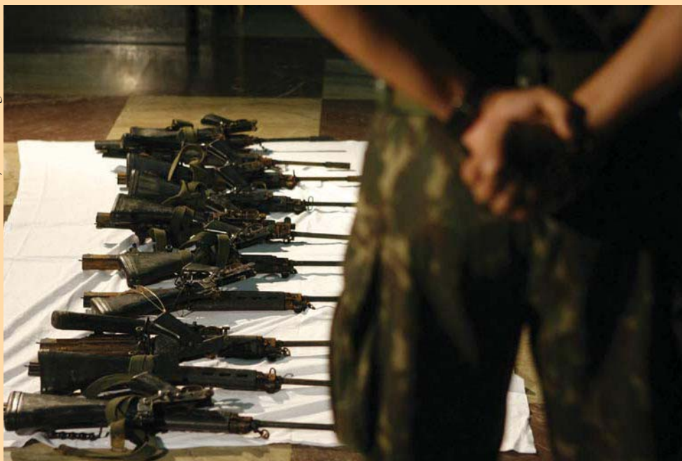
Presentation of ten rifles and a pistol that had been stolen by an armed gang from the Army Transport Center Establishment, in São Cristovão, Rio de Janeiro.

taken, or he can even be arrested by police who may either want to raise their stake in the game or simply do their job. He can also be accused of crimes that he did not commit, which is a way of “solving” criminal cases more quickly. There are professional pressures and efficiency goals in the institutions that co-exist with the ancient practices of violence and corruption.