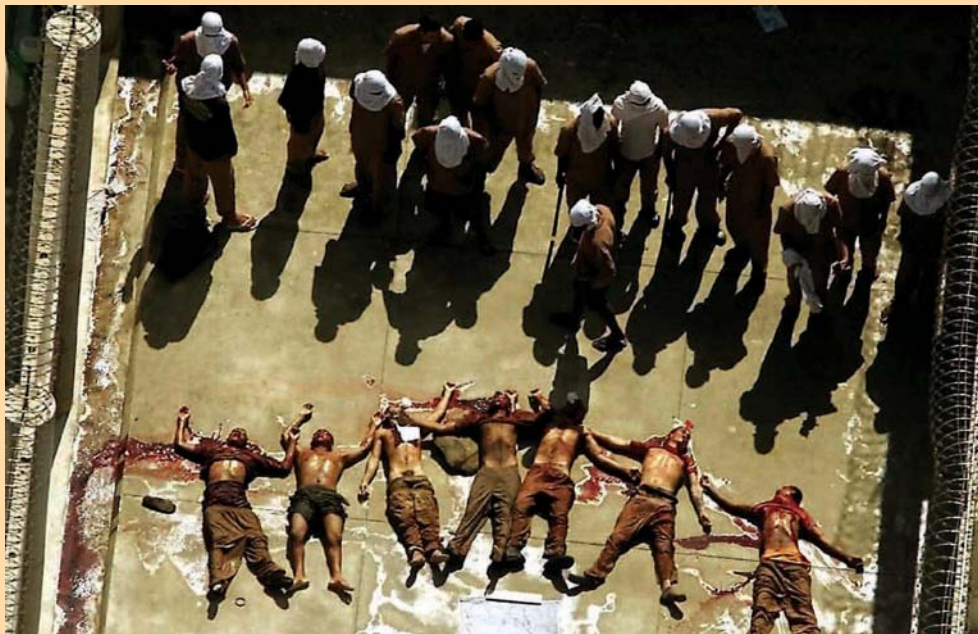
Rebellion in the Provisional Detention Center of Guarulhos (SP) which resulted in the deaths of seven inmates. Alongside the bodies are written the words The seven worm (sic) CdL, code for the Democratic Command for Liberty faction, a group rival to the CrBC (Revolutionary Brazilian Command of Criminality), accused of having committed brutal assassinations.

order, in particular the military police. Encouraged by the reigning impunity, 7 cases of torture and ill-treatment continued, as well as corruption and other illegalities practiced by government agents. In the dominion of the prisons, penitentiary agents found more than a few opportunities to confront higher authorities publicly committed to introducing institutional changes and implanting guidelines recognized to protect inmates rights. They provoked instability within the prisons by not providing services and by collusion with the movements that resulted in escapes and rebellions, and with the level of inmate deaths. The massacre of Carandiru, in 1992, with the death of 111 inmates, and the case of the 42 nd Police district of São Paulo were, exemplar in this sense. 8