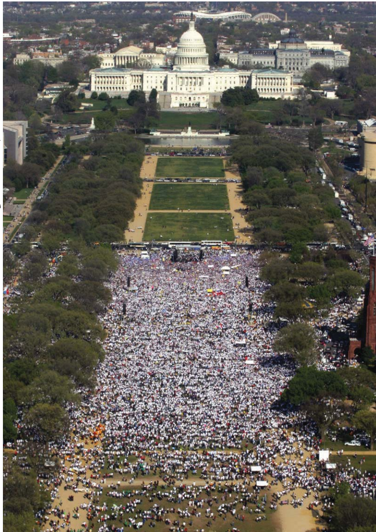
Protest in front of the White House, in Washington, against the immigration policy of the United States.

the major dimensions of the regulation theory about the emerging processes of internal and international migrations in different regions of the world. The author resumes the idea that used to be very dear to the hearts of the population scholars on the issue of the temporal and spatial reproduction of work in the capitalist society; each accumulation regimen corresponds, approximately, to a demographic regimen associated to it. Taking into consideration the transition from the fordism to the flexible accumulation and its most significant dimensions, the author concludes that the patterns of contemporaneous migration reflect two dimensions of the current capitalist regimen: its instability and the new structure of economic opportunities that emerges with the flexible accumulation. In this context, migration is