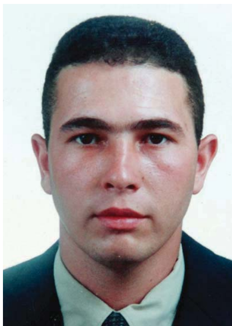
Jean Charles de Menezes (1978-2005)

In this context, the human rights have become the legitimate and accepted instrument of internal and international agreement. Thus, the migratory policies are celebrated and formulated based on this legitimation; the effectuation of this way is still quite distant of its concretization; there is much to do, by exploring the gaps that the proposals of international