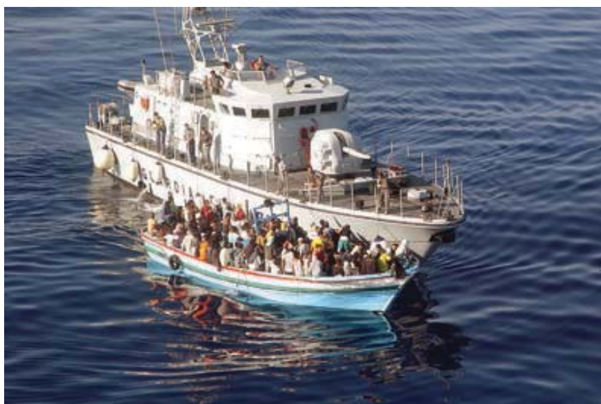
A boat carrying 177 illegal immigrants is intercepted by the Italian Coast Guard.

increasing volume of migrants; the transfers are performed with the help of profiteering middlemen “on duty” that transform them in lucrative bargains; reactions of xenophobia, intolerance, discrimination, and conflict are aggravated. Moreover, the actors that do not speak in the reports are speaking more and more in public manifestations and reclamations of social movements. It seems to be unavoidable, in dealing with the proposals of management of the international migrations, to take into account the voice of the involved actors – and such voice, in a clear and irreversible way, makes itself present in the increasing and powerful social movements.