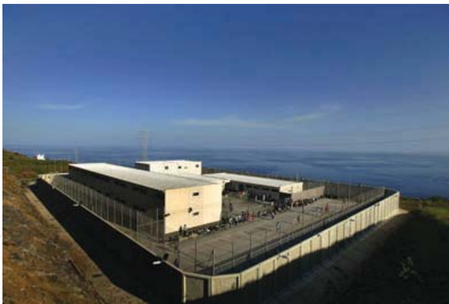
Illegal immigrants in the Detention Center of Hoya Fria, in Santa Cruz de Tenerife, Spain.

international migratory movements, clear and inevitable expressions of conflicts and still more acute contradictions in the present stage of the capitalist development; we should take into consideration, therefore, the implications of those discourses for the design of emergent policies on the contemporaneous international movements, in their multiple modalities and dimensions.