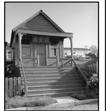
"Temple of Kwan Tai" CA HABS CAL: 23-MENC1, 13-1