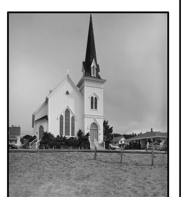
"Presbyterian Church" CA HABS CAL: 23-MENC1, 21-1