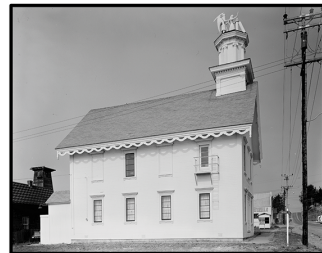
"Mendocino Masonic Hall" CA HABS CAL: 23-MENC1, 20-2