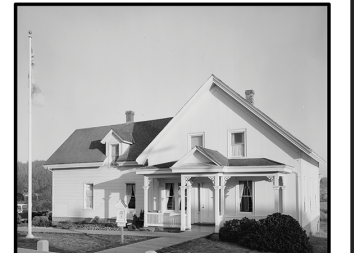
"Ford House Museum" CA HABS CAL: 23-MENC1, 5-1