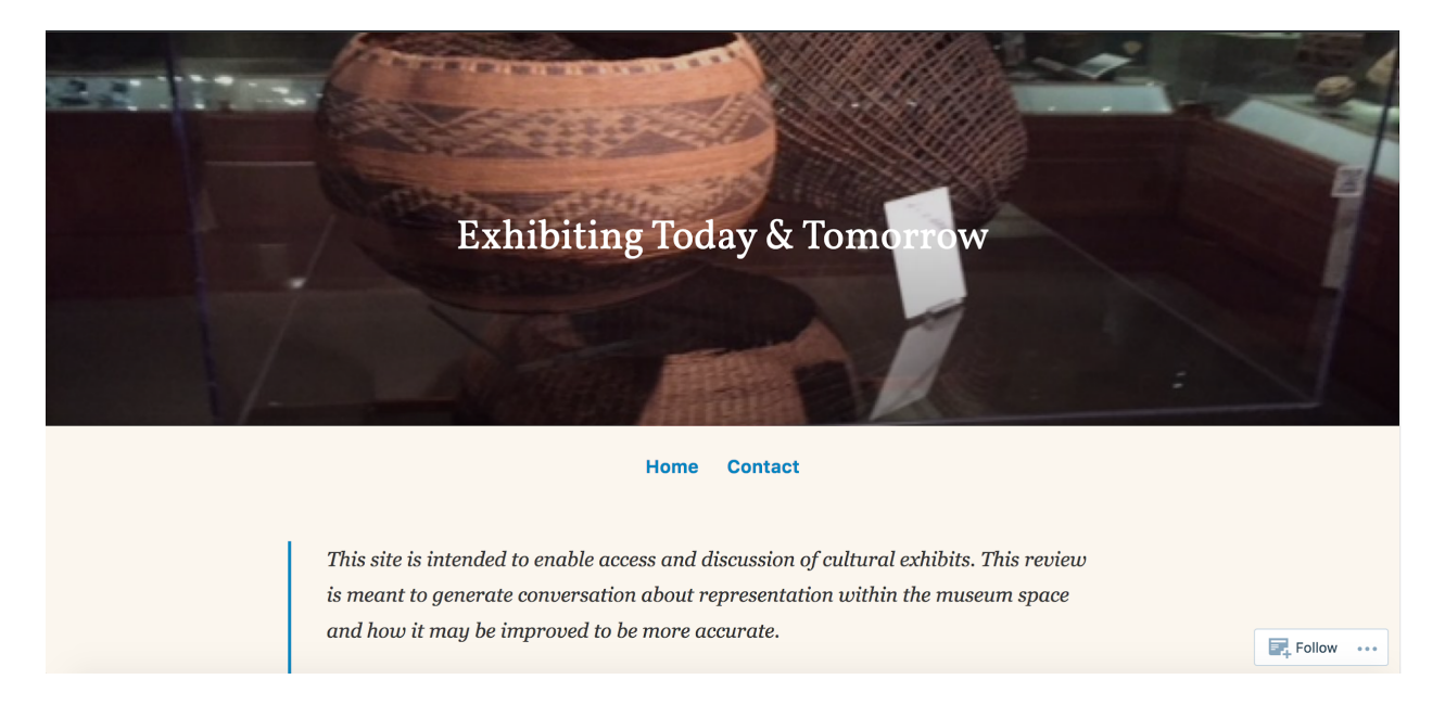
Figure 2 (Screenshot of Exhibiting Today & Tomorrow homepage)

The production of this platform is meant to enable the consumers to essentially have more of an active response to what is being presented to them. And effectively, this adding of members to the conversation is meant to voice to creators possible gaps within perceptions being represented and displayed.