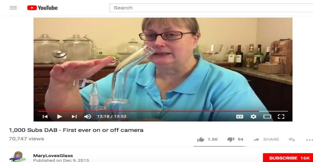
Figure 3 7 Example of Feeling the Nail

“MaryLovesGlass” is taking a first-time dab by herself. After heating the nail, she places her hand over the nail and says: “It’s pretty hot. Pretty hot. Waiting, waiting. Scared. Waiting. Oh, I really heated that up.” Mary waits a total of 43 seconds while feeling the top of the nail before she says: “Let’s try it. Cheers everybody.” before taking her first-ever dab. The picture example above shows MaryLovesGlass holding the dab rig in one hand while placing the other hand over the top of the nail to feel for the heat that rises off the nail. Once the heat that is rising begins to subside, dabbers will then consider the nail “cool enough.” and will place the dab down on the nail and begin inhaling.