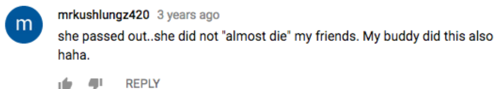
Figure 5 9 YouTube Comment #3