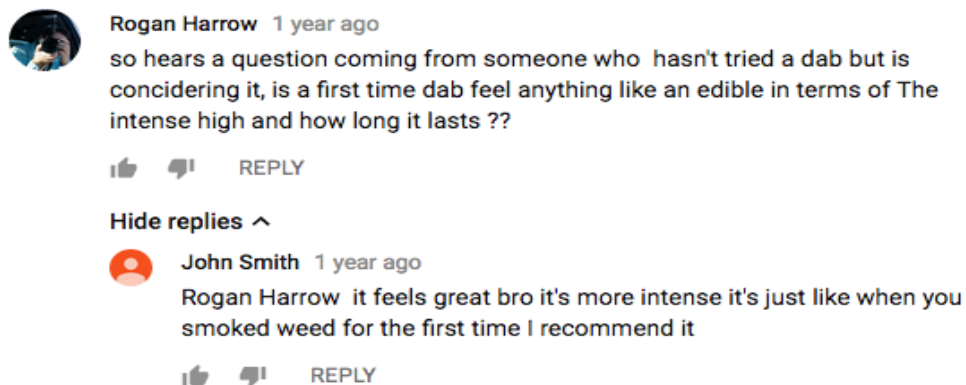
Figure 6 10 YouTube Comment #4

John Smith replies and “coaches” Rogan that the high feels great and that it is much more intense than edibles. John then says it is like “smoking weed for the first time” and recommends that Rogan give it a try. This is just one example of many pertaining to social learning theory in relation to first-time dab use that is quite similar to the findings of Becker (1953). The data showed evidence that novice users are taught to learn to smoke dabs in a way that produces real effects by being “coached” through the process of their first dab use by more seasoned and experienced users. Second, users are being taught what being high on dabs is like as their told “You’ll get so high! It’s like your first time ever smoking weed all over again” among other things. Although most videos did not show the entirety of the high experienced from first time dab use, from