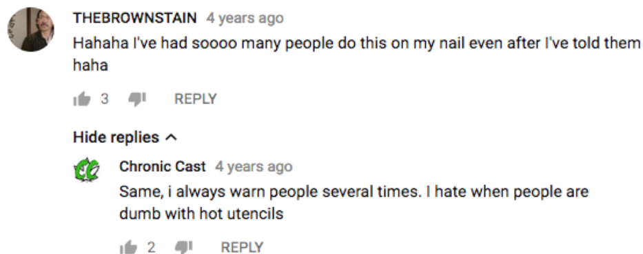
Figure 2 6 YouTube Comment #1

The YouTube user exchanges presented on the next page are public information from the video "dome-less nail dab fail's" comment section and are example of the types of interaction and engagement between two YouTube community members regarding first-time dabbers not understanding the hot nail in the same way as the novice dabber in the video they watched.