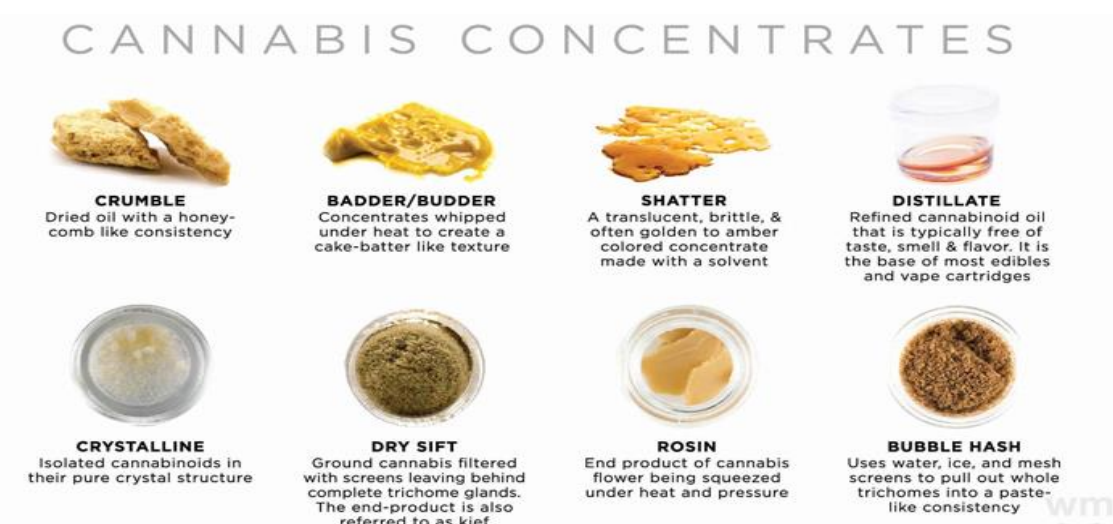
Figure 1 2 Types of Cannabis Concentrates

While hash oil and cannabis concentrates in the form of hashish and other substances are not new to the cannabis industry, this route of administration and method of delivery that consists of heating a nail and fully incinerating the cannabis concentrate for inhalation seems to have taken on considerable popularity in recent years (Varlet et al. 2016). The rise in popularity of dabs also brought new routes of administration, and types of products available on the market are being created specifically for this niche of cannabis consumers. Cannabis concentrates can be utilized and ingested in many forms, such as through vape pens, cooked into edibles, and applied to cannabis flower and combusted simultaneously.