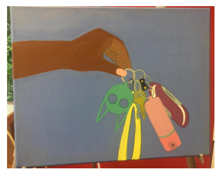
Figure 3 Painting created by anonymous participant

and twist those yarn balls together. The rest of the room was taken up by a collaging table and a table for snacks and the poetry exercises. Aside from the project participants, six people attended the event.