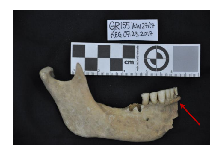
Figure 6: Periodontal disease in an adult female. Bezławki, Poland.