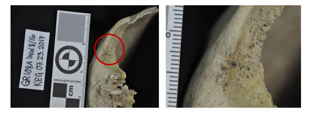
Figure 9: Healed cribra orbitalia in an adult female. Bezławki, Poland.

more commonly than porotic hyperostosis and is therefore often considered to be a more sensitive biomarker of stressful stimuli (Aufderheide and Rodriguez-Martin, 1998). Figure 9 provides an example of cribra orbitalia.