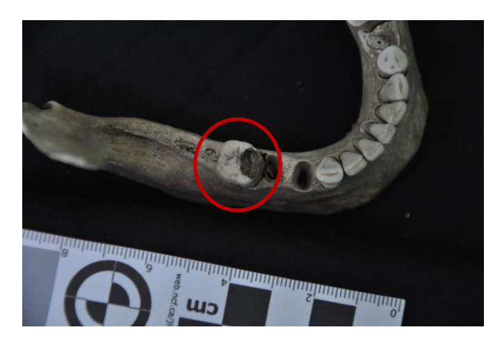
Figure 8: Large dental caries in an adult male. Bezławki, Poland.

tissue is destroyed, and cavities begin to form (Waldron, 2009). Caries at the tooth apex are also common (Waldron, 2009). Dental caries are most often observed on the molars, followed by the premolars and then canines and incisors (Hillson, 1996). Caries prevalence increases with age (Waldron, 2009). Figure 8 provides an example of dental caries.