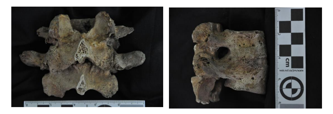
Figure 11: Intervertebral disc disease in an adult male. Bezławki, Poland.

Intervertebral disc disease is common in archaeological samples and can be diagnosed based on the presence of both marginal osteophyte formation and pitting on the surfaces of the vertebral bodies (Waldron, 2009). Ultimately, fusion may occur between osteophytes of adjacent vertebrae as the vertebral central continues to deteriorate, as shown in figure 11 (Marklein et al., 2016). The presence of Schmorl's nodes further indicate a diagnosis of intervertebral disc disease (Figure 12).