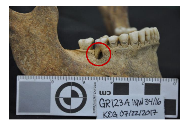
Figure 7: Periapical abscess in an adult female. Bezławki, Poland.

Dental caries vary in appearance depending on their severity (Hillson, 1996). Caries are generally observed in the early stages as white or brown spots on the surface of enamel (Waldron, 2009). As caries spread into the dentine, progressively more dental