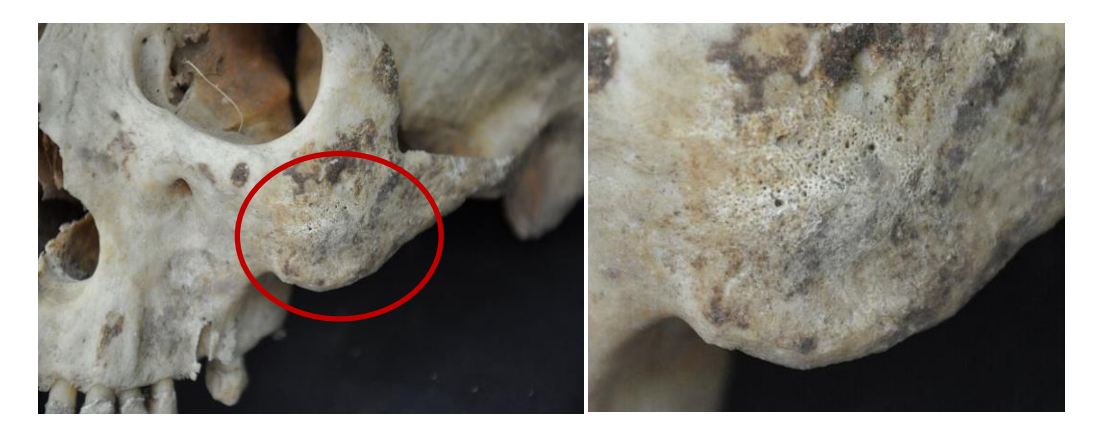
Figure 5: Active periosteal lesions, Adult Male. Bezławki, Poland.