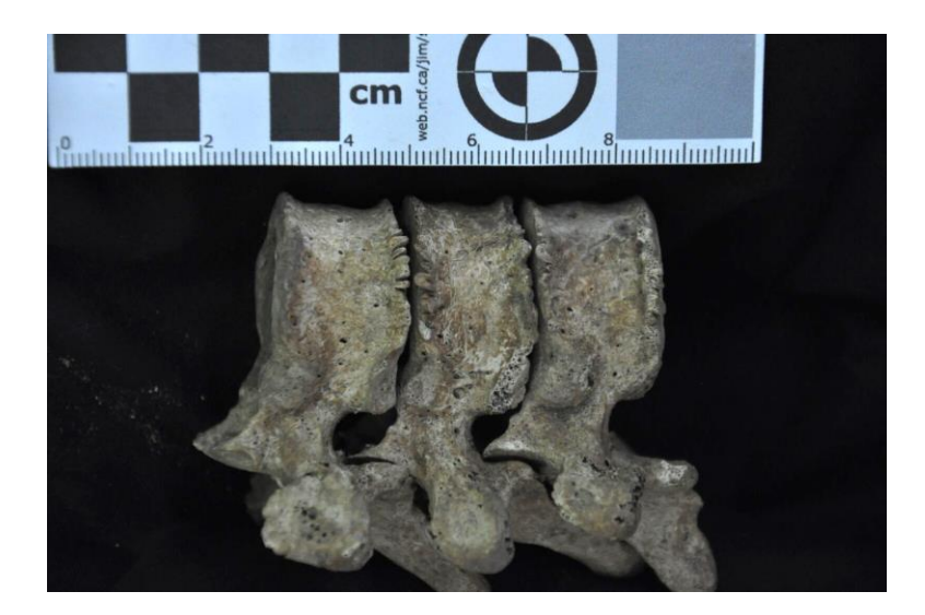
Figure 10: Spinal OA in an adult female. Note the osteophytes present at the margins of the vertebral bodies. Bezławki, Poland. Photo by K. Gaddis (2017).