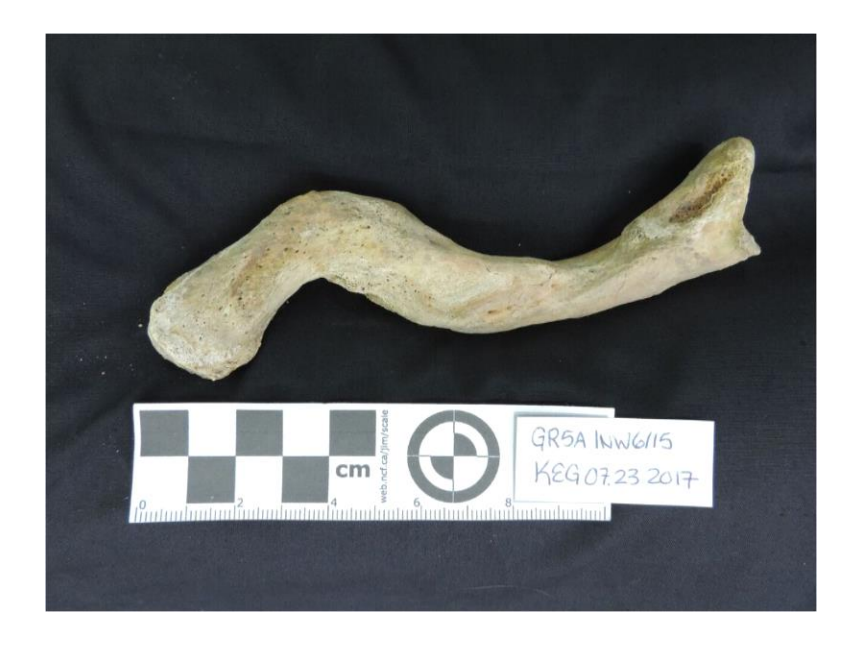
Figure 14: Clavicle fracture in an adult male. Bezławki, Poland.

occurrences of trauma were given the same score as single occurrences. If no trauma was observed, the individual received a score of "0" for this category. Figure 14 provides an example of trauma in an individual from the Bezławki research sample.