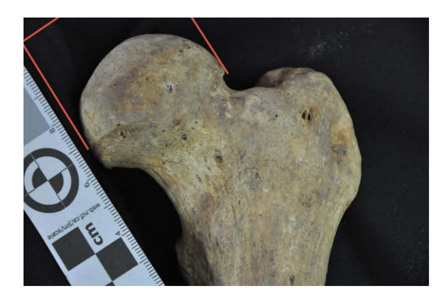
Figure 3: Example of Femoral Head Diameter Measurement. Bezławki, Poland.

Criteria for scoring skeletal robusticity are similar to those outlined previously for stature. Individuals were considered to be at higher risk of frailty if they fall within the lowest quartile of femoral head diameter for their sex cohort. Therefore, individuals who fell within the lowest quartile of femoral head diameter for their age and sex cohort will receive a score of "1", while all others received a score of "0". Again, quartiles were compared only within sex cohorts to avoid complications due to sexual dimorphism.