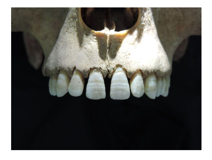
Figure 4: Linear Enamel Hypoplasia in a sub-adult. Bezławki, Poland.

Linear enamel hypoplasias are typically observable macroscopically upon examination of dental surfaces under good lighting conditions (Figure 2; Yaussy et al., 2016). During analysis for this research, LEH were scored as being either present or absent. For this research study, linear enamel hypoplasias were indicated as being present if they were observable through macroscopic analysis on at least one tooth. Individuals scored as present for linear enamel hypoplasias were considered to be at higher risk of frailty and therefore received a score of "1" for this category of the Skeletal Frailty Index. Individuals with no enamel hypoplasias were assigned a score of "0".