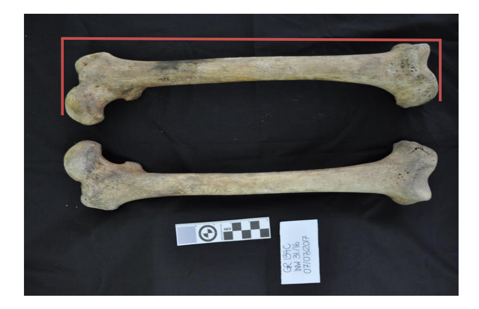
Figure 2: Example of Maximum Femoral Length Measurement. Bezławki, Poland.

measured. Individuals for whom a maximum femoral length measurement could not be accurately determined were excluded from the sample. Stature was compared within sex cohorts to control for variation related to sexual dimorphism, as outlined by Marklein and colleagues (2016). Metric quartiles of maximum femoral length were determined for each age and sex cohort using Excel version 16.10. Individuals of indeterminate sex were considered as a separate group, regardless of age.