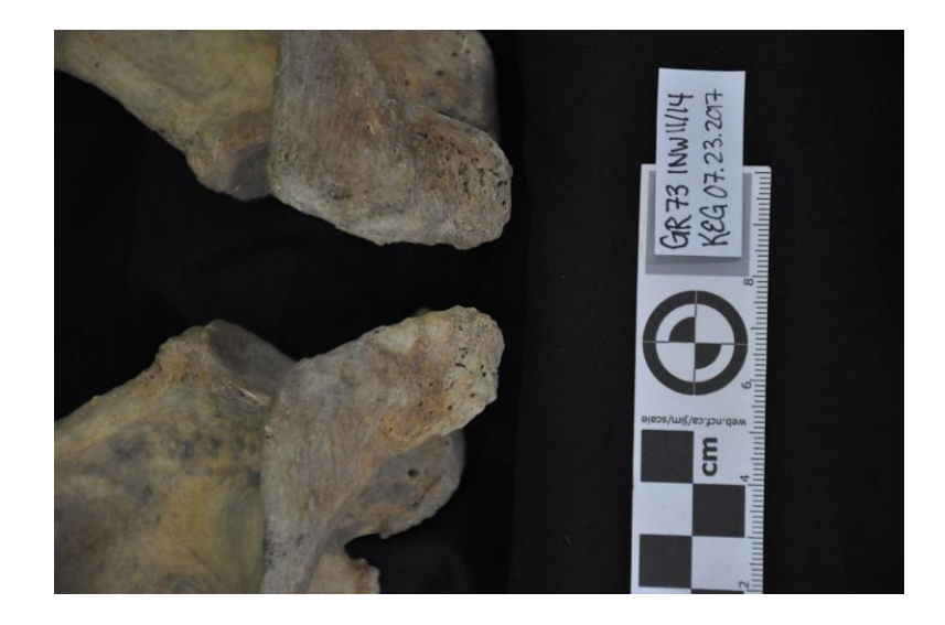
Figure 13: Abnormal porosity of the acromion associated with rotator cuff disorder in an adult male. Bezławki, Poland.