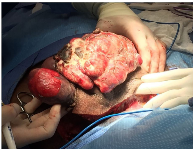
Figure 1. Resection of the lesion was performed with wide surgical margins from the left mid-clavicular region. The largest mass measured 16 × 15 × 7 cm and the smallest mass measured 7 × 6 × 3 cm.

Dermatofibrosarcoma protuberans (DFSP) is a relatively rare soft tissue sarcoma with an estimated overall annual incidence of 4.2 cases per one million persons per year. Black people are affected at almost