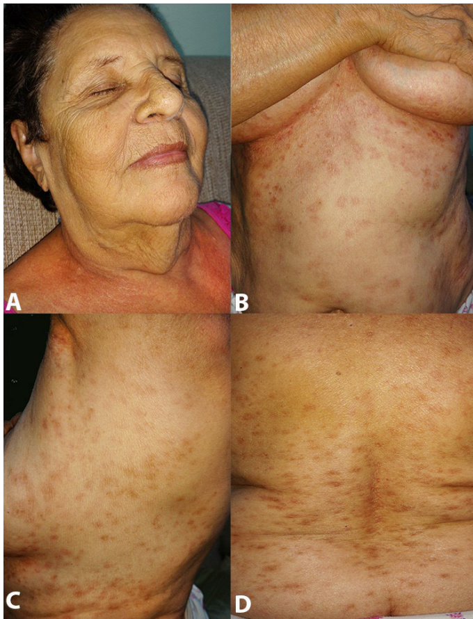
Figure 4. Cutaneous examination after the sixth month of therapy. The face is free of lesions - A ; and some erythematous scar-like lesions remain on the trunk - B, C and D .

in a response to primary disease. The nomenclature of histiocytosis has changed substantially over the last half century, which is now based on the primary involved cell in the pathophysiology of the disease.