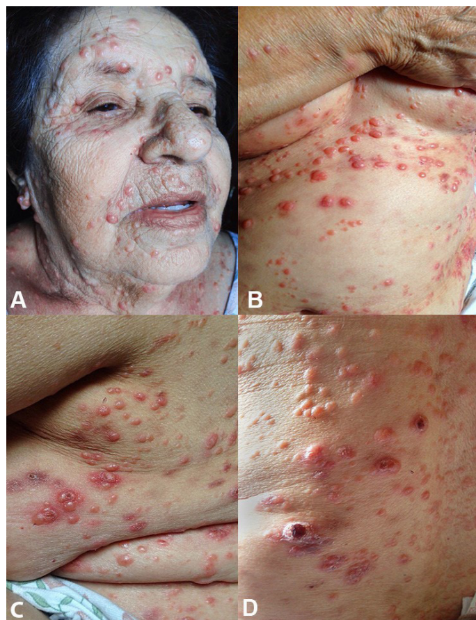
Figure 1. Skin examination showing in A - disseminated nodular lesions over the face; B - over the trunk and the inframammary region; C - over the lateral face of the thorax; and D - over the back.

With the diagnosis of IC histiocytosis of exclusive cutaneous involvement (single multifocal system), corticosteroid (prednisone 0.5 mg/kg/day) was started but the patient's blood pressure increased. Muscular pain and headache ensued and another treatment modality needed to be scheduled. Taking into account the patient's intolerance to the intermediate steroids dose, age, and comorbidities, a reasonable option was local therapy, so the patient was treated with narrowband ultraviolet B (UVB) phototherapy three times a week for 2 months. The lesions started effacing after the first month of the phototherapy and completely subsided on the third month leaving local hyperpigmentation. The patient is now at the sixth month of follow-up and is completely symptomless (Figure 4); she did not report any adverse reactions.