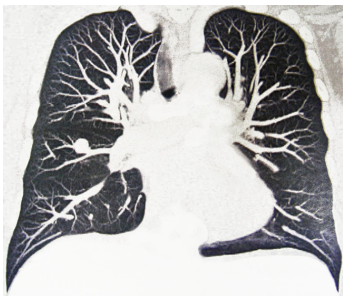
Figure 1. CT of the thorax (coronal reconstruction) suggesting that the pulmonary nodule might be a small PAA.

Bronchoscopy showed no abnormalities, and cytological brushing was negative for neoplasia. The diagnosis of a solitary peripheral PAA was considered, and surgery was recommended. A right muscle-sparing fifth intercostal space thoracotomy was performed. Examination revealed a 2 cm peripheral, pulsating nodule in the medial segment of the middle lobe. The nodule was soft and had a palpable thrill. No other lung or vascular lesions were identified. After dissection of the oblique and horizontal fissures, the interlobar artery and the main arteries to the middle lobe had a normal appearance. Due to the risk of bleeding, the lesion was not biopsied. A middle lobectomy was performed. The patient had an uneventful recovery and was discharged from the hospital on the fifth post-operative day.