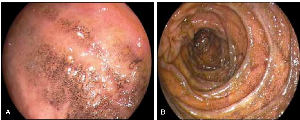
Figure 1 – Endoscopic view of duodenal bulb (A) and second portion (B), showing multiple and speckled black spots.

Histological examination showed multiple foci of a brown-black granular pigment, mostly inside macrophages within the tips of the villi (Figure 2). Perls' prussian blue stain for iron and Masson-Fontana