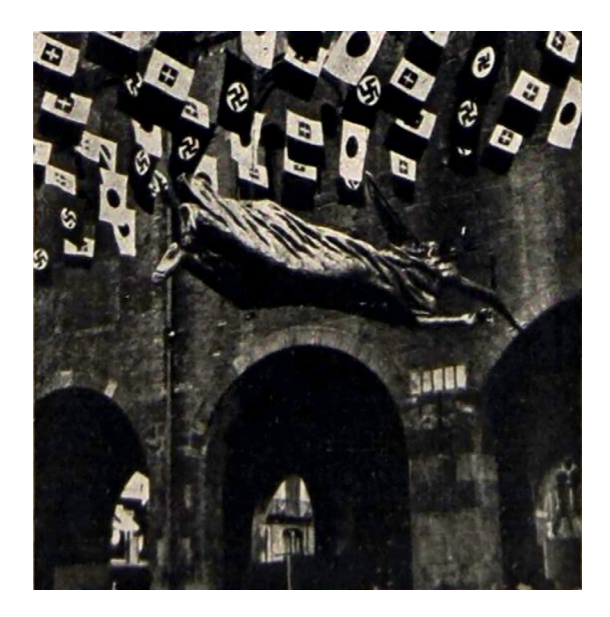
Figures 3, 4 e 5. Bo, Castiglioni, Pagani, setting of the "War poster exhibition" in Milan, photographs. Source: article RAVA, C.E. Addobbi delle citá o l'architettura delle cerimonie. Lo Stile nella casa e nell'arrendamento, n. 19-20, p.79-81, jul-ago 1942.