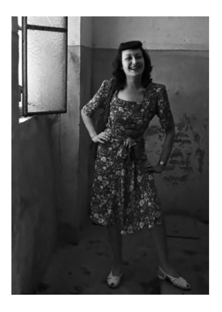
Figure 1 - Lina Bo, Milan, "Baia del Re" quarter, 1946.

<sup>3</sup> OLIVEIRA, O. DE. Lina Bo Bardi. Obra construida. 2G revista internacional de arquitectura, n.23-24, 2002.