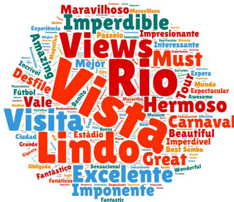
Figure 3 – Wordcloud