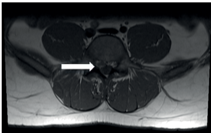
Figure 1: A magnetic resonance image showing a cystic lesion with hypointense signal on T1.

Magnetic resonance imaging (MRI) demonstrated a cystic lesion with low-signal intensity on T1-weighted imaging and high-signal intensity on T2-weighted imaging at the level of the L4-L5 disc (figure 1, 2). The cystic mass, located in the ventral aspect of the extradural space, displaced the thecal sac dorsally. The L4-L5 intervertebral disc appeared to have mild degeneration (figure 3). In the axial view it was located in the center laterally to the right side in the spinal canal, compressing the L5 transversing root (figure 4).