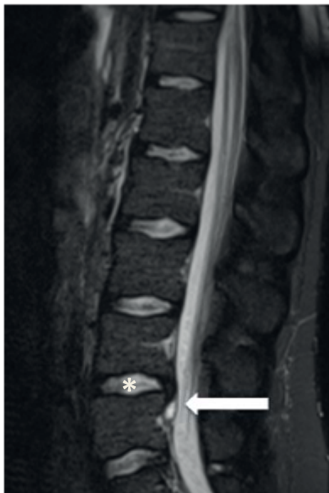
Figure 3: Sagittal magnetic resonance image showing cystic lesion (arrow) and mild L4-L5 disc degeneration (asterisk).