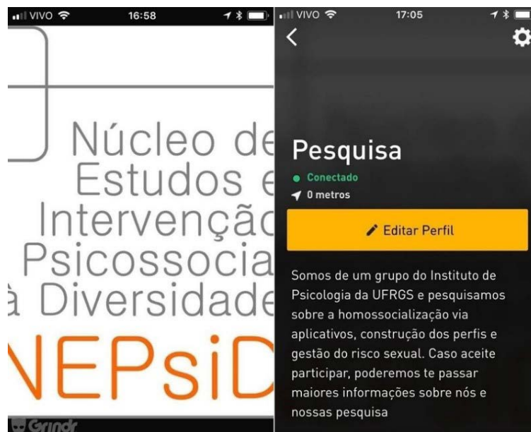
Figure 1. Photo and description of the created institutional profile

We are a group of the Institute of Psychology of UFRGS and our research focuses on homosocialization via applications, creation of profiles, and management of sexual risk. If you accept to participate, we can give you more information about us and our research.