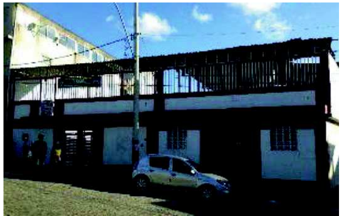
Figura 13: Recreativo Plataformense Club – 2015.

It is much more difficult to obtain information about the most popular clubs, since data regarding their architectural features is almost inexistent. Nevertheless, it is known that the city contains carnival and sports clubs. Regarding the former, remnants remain of the Filhos da Liberdade Carnival Club, Democrata and Rosa do Adro (CADENA, 2013, p.102). In terms of the latter, the first buildings of Corinthians de Plataforma, São João de Deus and Palestra appear, but their premises are demolished on unknown dates. The second building of the Corinthians (figure 12) is completely ruined (SANTOS, 2014). The only club which remains and which has some modernist references, but is in a very unstable condition, is that of the Recreativo Plataformense (Figure 13) (PORTELA, 2015).