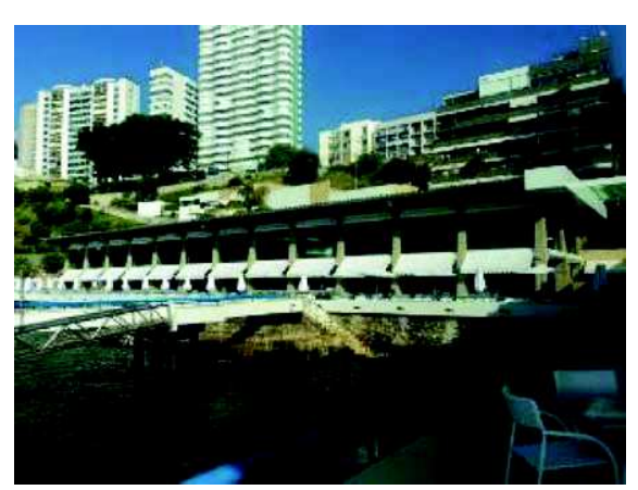
Figure 4: Yacht Club – 2015

Following the demolition of its previous premises and the construction, in 1958, of a pier, the new Yacht Club (Figures 4 and 5) is inaugurated in 1973. The architects Silvio Robatto and Alberto Fiuza adopt a prismatic block which is connected to two decks, with a hollow lower part and an upper part that initially connects the hollow and sealed parts. This allows for a wide terrace in the lower part, thereby ensuring profound integration between the building and its surroundings. The element that enables this is the robust exposed concrete structure, which is used in a modulated and rhythmic fashion. According to the architects, these columns are "oversized in the open area below, so that the iron armature of the pillars remains well within the concrete and well-protected against corrosion. For aesthetic reasons, this was constructed in a triangular form (MAIA, 1995: p.131). It is a well-resolved design and one that adapts well to its surroundings; it exists to this day.