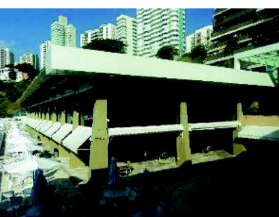
Figure 5: Yatch Club – 2015; Source: Ana Carolina Bierrenbach