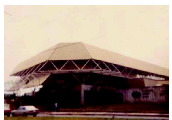
Figure 9: BANEB Athletics Association – 1986.

blocks of different sizes and materials. The upper block facades are composed of rhythmic openings, which do not allow for a very pronounced integration between the interior and exterior. This is not a very brilliant architectural solution and is eventually removed.