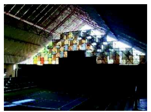
Figure 10: Baiano Tennis Club Gymnasium – 2015; Source: Ana Carolina Bierrenbach