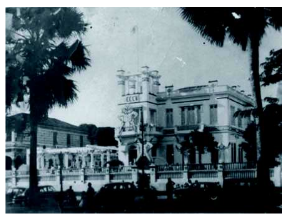
Figure 1: Cruz Vermelha Carnival Club – n.d.; Source: Arquivo Histórico do Município de Salvador/FGM

One of the styles most frequently adopted by the clubs is the neo-colonial, which appears in the Bahia Athletics Association , inaugurated on 25/01/1941.