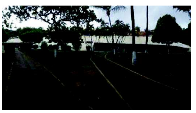
Figure 11: Banco do Brasil Athletic Association Centre – 2015.