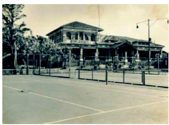
Figure 2: Baiano Tennis Club – n.d.