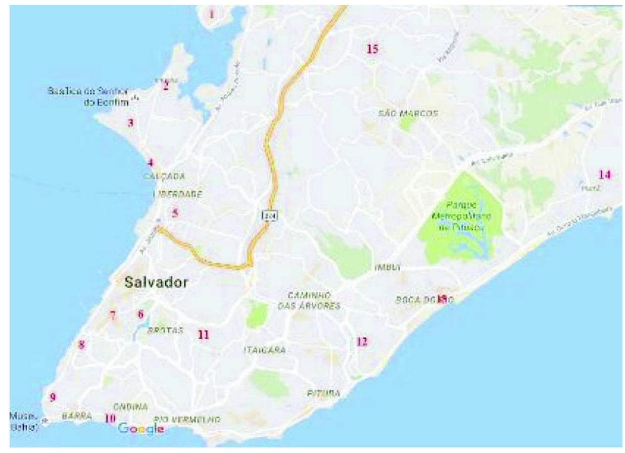
Figure 14: Locations of Salvador clubs. Area 1 - Plataforma - Corinthians de Plataforma Club, Palestra de Plataforma Club, Recreativo Plataformense Club, São João Football Club; Area 2 - Ribeira - Guaraní Sporting Association, Itapagipe's Regattas Club, Humaitá Sport Club. Area 3 - Monte Serrat e Boa Viagem - Itapagipe's Yacht Club, Corinthians Sport Club, Military Police Officers Club, Império Athletics Club, Rosa do Adro Carnival Club. Area 4 - Mares - Recreativo Palmeira Athletics, Vera Cruz's Regattas, Santa Cruz Sport Club. Area 5 - Liberdade/ Caixa d'água - Filhos da Liberdade Carnival Club, Nego Athletic Club. Area 6 - Nazaré /Dique - Democrata Club; Innocentes em Progresso Club (2nd and 3rd premises). Area 7 - Piedade/2 de julho - Innocentes em Progresso Club (1st premise), Portuguese Club (1st premise), Commercial Club, Botafogo Sport Club, Fantoches da Euterpe Club, Bahia Sports Club (2nd premise). Area 8 – Campo Grande – British Club, Spanish Club (1st premise), Cruz Vermelha Carnival Club, Germânia. Area 9 – Graça/Barra – Amazonas Foot-ball Club, Banco do Brasil Athletic Association (1st premise), Bahia Athletics Association, Baiano Tennis Club, Bahia Sports Club (1st centre), Vitória Sports Club (1st premise), Sport Club Palmeira, Yatch Club. Area 10 - Barra/Ondina - Spanish Club, Lido Club. Area 11 - Brotas e Campinas de Brotas - Coumbia Sport Club, Unidos de Brotas Sport Club. Area 12 - Armação - BANEB Athletic Association. Area 13 - Boca do Rio - Bahia Sports Club (Beach Premise). Area 14– Piatã – Banco do Brasil Athletic Association (2nd Premise). Area 15 – Vila Canária – Ypiranga Sports Club (2nd Premise).