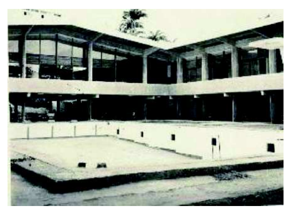
Figure 8: Banco do Brasil Athletics Association – n.d.