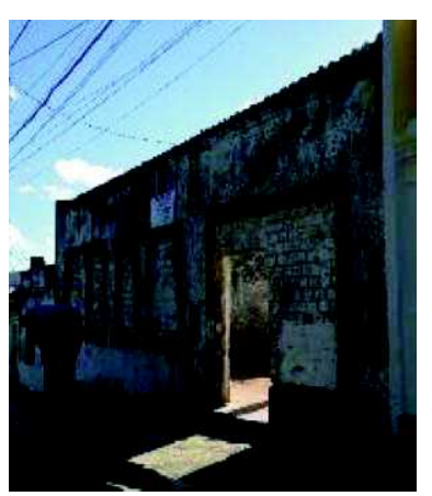
Figura 12: Corinthians de Plataforma Club – 2015.