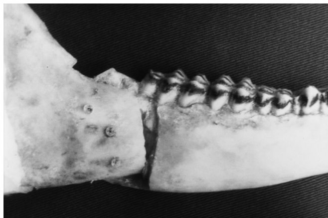
FIGURE 2 - Bend of distal segment, by absorbable screw deformation.

the difference between both groups was not statistically significant.