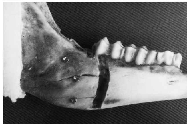
FIGURE 3 - Lateral cortical fractures on the proximal segment, common in the metallic screw group.

The sheep mandible has been used for experimental studies of osteotomies and rigid internal fixation in the ramus area, mainly due to the similarities in format, size and structure to the human