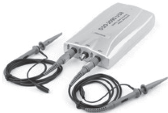
Figure 1. DSO 2090 with two channels

In the anterior region, the first point was located 10 cm away from the nipple, in apical direction. The second one was 2 cm medially away from the nipple, and the third one, 10 cm below the nipple, approximately 10 cm to the side. The procedure was repeated in the contralateral hemithorax. In the posterior region, six points were also determined, three in each hemithorax. The first one was located 5 cm away from the spinal process of C7, in the