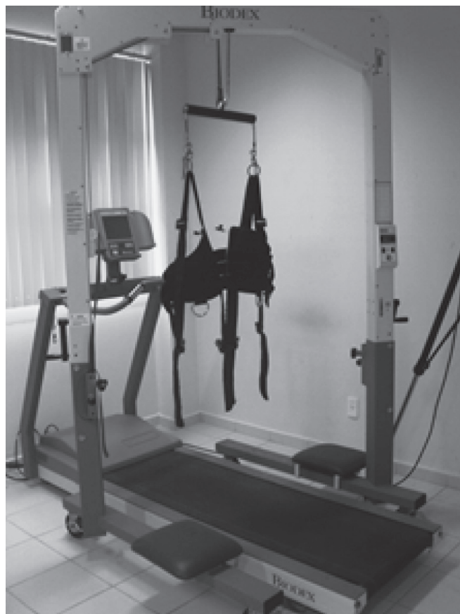
Figure 2. Treadmill

Patients were oriented to walk an 8-meter distance at maximum comfortable speed while performing a cognitive task. As they were walking the distance, a letter of the alphabet would be chosen and they were supposed to speak as many words beginning with that letter as possible. Ten dynamic collections were conducted.