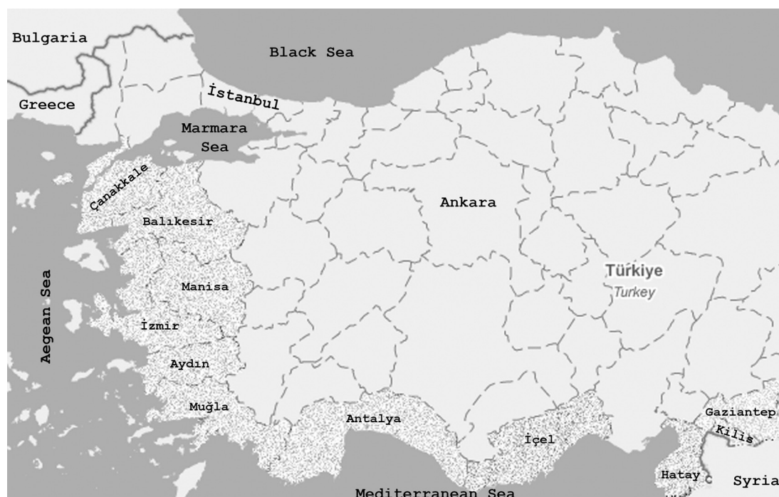
Figure 1 – Map of Turkey showing the provinces where leaf samples were collected. Çanakkale and Balıkesir are in the Southwestern Marmara Region, Aydın, İzmir, Manisa and Muğla are in the Aegean Region, Antalya is in the Western Mediterranean Region, İçel and Hatay are in the Eastern Mediterranean Region, and Gaziantep and Kilis are in the Southeastern Anatolia Region. The part of Turkey shown on the map is located between 36°00' and 42°00' N, and between 26°00' and 38°00' E.