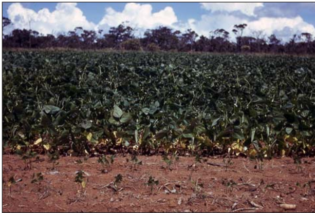
Figure 2 - Photo of the first crop of soybeans growing in a demonstration plot on Oxisol 1 soils (probably Latossolo Vermelho Distrófico 2 ) in the Distrito Federal, 1974. Note the two rows of soybeans in the foreground growing on unfertilized soil are only a few centimeters high and will not survive while plants more distant from the camera, growing where adequate lime and phosphorus fertilizer were added, are healthy and on their way to producing a good yield. Natural ‘cerrado’ vegetation is seen in the background.

watershed (IBGE, 2001) (Figure 1b). Within the basin a distinct contrast in soils occurs west of the Negro and Madeira rivers (Figure 1b). To the east of these rivers Oxisols 1 (Latossolos 2 ) dominate. To the west and extending into Peru most parent materials contain more weatherable primary minerals and appear to be sediments derived from erosion in the Andean mountains. Most of the soils are Ultisols and Alfisols 1 (Argissolos, Nitossolos and Plintossolos 2 or Podzólicos in Camargo et al., 1981).