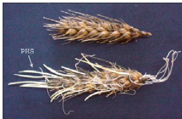
Figure 1 - Damage of pre-harvest sprouting in a highly susceptible cultivar, BR 18, after a period of rain in the field, and a highly resistant cultivar Frontana, in Londrina, State of Paraná, Brazil, 2004. The arrow shows the symptom of pre-harvest sprouting (PHS) in BR 18.

therefore a highly desirable but complex trait that is regulated by a number of key resistance genes that strongly interact with environmental conditions. Several workers have noted that seed dormancy appears to be closely associated with red grain color. However, PHS occurs sporadically in all red commercial varieties, implicating that the red-grained genotypes alone do not always guarantee effective resistance (Flintham & Gale, 1988; Flintham, 2000).