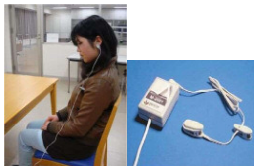
Fig.3 Heart Rhythm Scanner (HRS)