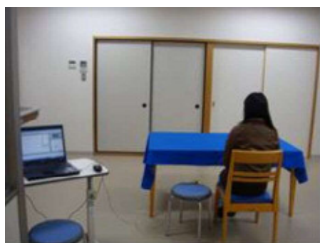
Fig.1 experiment environment

A room at our school, built to simulate a model standard home (Fig.1).