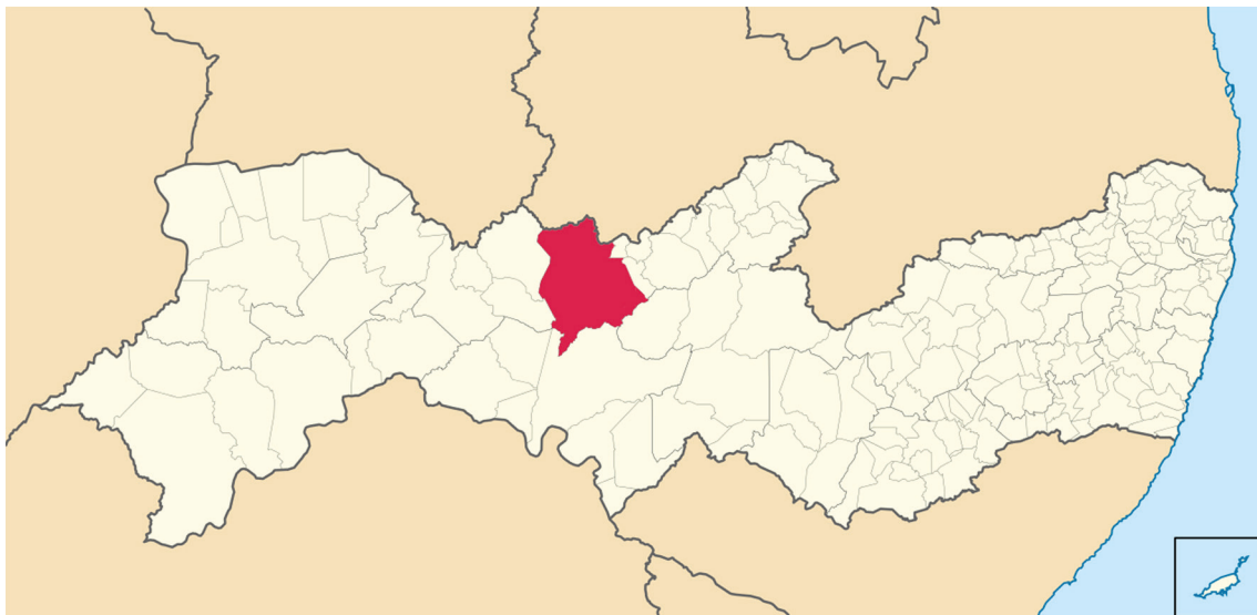
Figure 1 - Serra Talhada county, the place where the three patients acquired CDM, was highlighted within the territory of Pernambuco State.

CDM or valley fever should be suspected in patients with cough and fever who live in endemic areas 8 . However, the diagnosis can be difficult in areas, such as Pernambuco State where the levels of suspicion is low as no cases of CDM have been reported so far, patients present with a variety of clinical manifestations and access to diagnostic tests is poor. CDM was difficult to diagnose because the presence of this infection was previously unknown in Pernambuco. The lack of a routine diagnostic laboratory testing specific for CDM makes the diagnosis very difficult 9 .