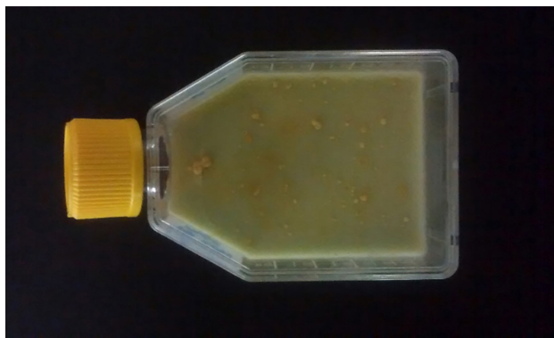
Figure 1 - Yellowish and creamy appearance of M. avium colonies in Lowenstein-Jensen medium after 20 days of incubation.